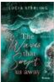
ca. 400 pages • 13,6 × 20,5 cm ISBN 978-3-95818-814-3

They save lives, but who saves them? Malibu beach vibes with a tragic twist in this new thromance dilogy.