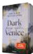
Deep Water (Dark Venice 1) 448 pages • 13,6 × 20,5 cm ISBN 978-3-95818-788-7 Sold to: Hungarian, Hungary (General Press Könyvkiadó)

Merle's world is turned upside down after witnessing the incriminating recording of Matteo and his friends abandoning their friend Tino to die in the lagoon. As Matteo faces the legal consequences, she is ostracized at university. But the truth about that fateful night remains clouded in mystery.