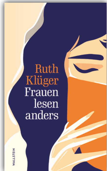
Ruth Klüger Women Read Differently